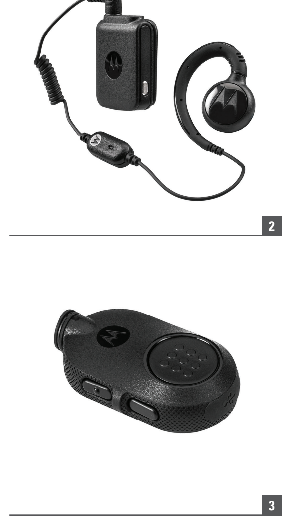
1. SL7500 2. RLN6500 Bluetooth Accessory Kit